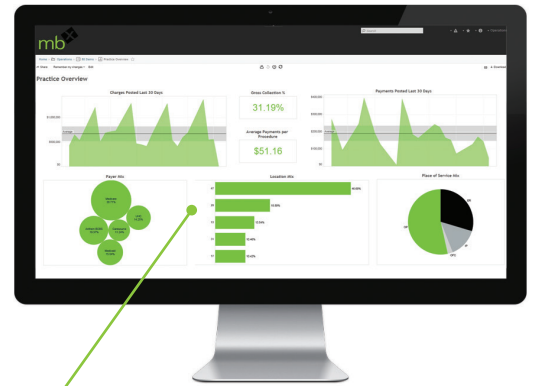
Practice Overview – Charges by post date, payments by post date, payer mix, location mix, places of service mix, gross collections, and average payments per procedure.