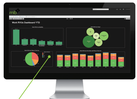
Productivity Dashboard – Productivity data is displayed in a dashboard format that provides information in real-time keeping operations effectively aligned with revenue cycle targets.